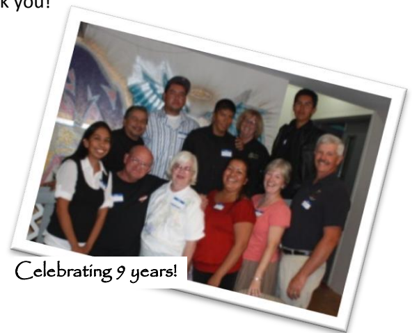
Celebrating 9 years!